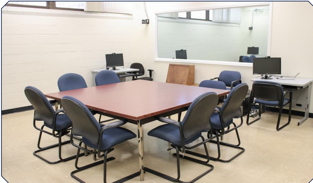
LUCIA Room 1206

Usability refers to whether a product, artifact, website, etc. is easy to use, and whether it helps users meaningfully complete their tasks, goals, and/or activities effectively. Interaction, on the other hand, is about how users interact with a product. It focuses on making interactions (e.g., swipes, clicks, visual feedback) instinctual and easy to understand. In contrast, accessibility usually focuses on making the Internet more accessible for those with disabilities (e.g., hearing or vision loss). However, it also applies to physical product design. Collectively, these factors encompass a user's holistic experience with a product, service, etc., what is called User Experience (UX). UX emphasizes understanding and measuring users' emotional reactions to products.